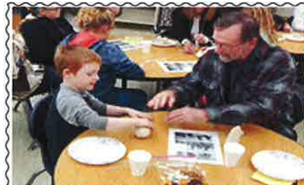
Lincoln Elementary hosted Family Night where the families traveled to different stations celebrating stories of the imagination, created one of a kind works of art, and listened to live musical performances.

After January 3, 2018, parents are asked to schedule an appointment for the preschool screening or the Early Beginnings screening by calling 647-1418. Walk-ins will be given an appointment and asked to return at a later time.