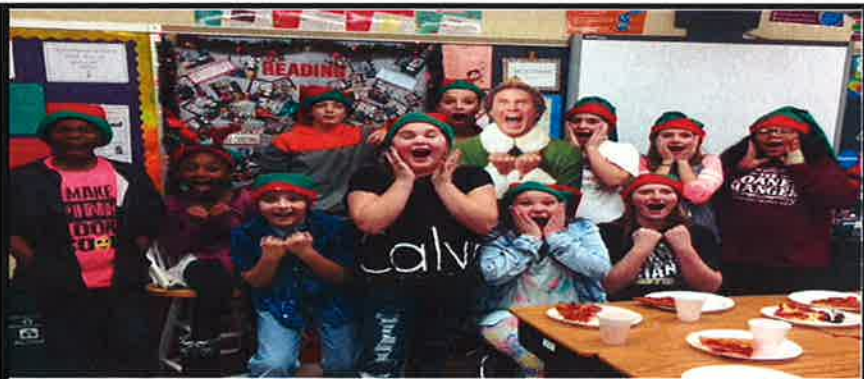
Ingersoll Middle School Project H.O.P.E. students celebrating together before break. They have been a great group who have already made an impact toward the anti-drug initiative during red ribbon week, and when we come back from break they will start planning the annual kindness week that takes place at the end of January.