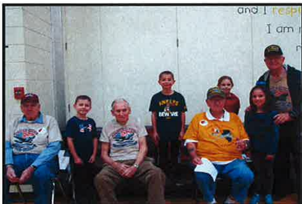
Eastview students posing with our Veterans during Nets for Vets Fundraiser.

As we go into the Holiday Season and another year comes to a close I want to say Thank You to all of the staff, parents, and volunteers that have helped make Eastview the AMAZING school that it is. Eastview couldn't accomplish all we do without the tremendous support received from all of these people. I look forward to another great year and wish everyone a Happy and Healthy 2018!