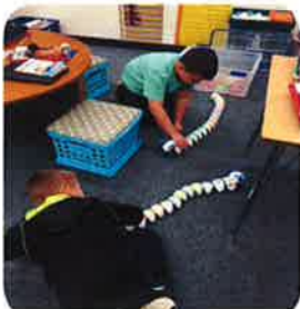
Left: Westview students learning how to code an animated caterpillar.