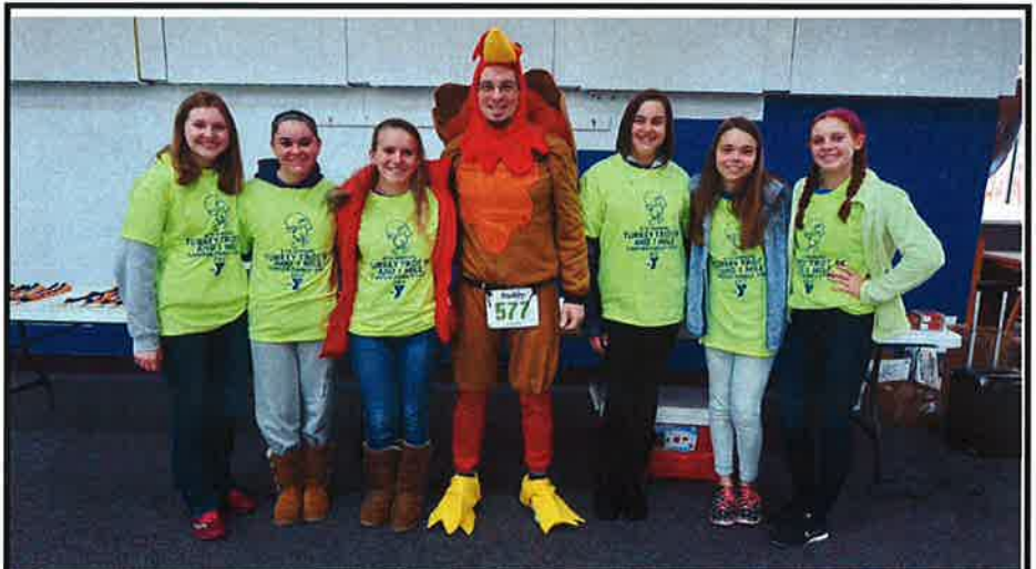
CHS Key Club members who volunteered for the YMCA Turkey Trot.

Additional District 66 Events are listed in the 2017-2018 Activity Calendar at www.cantonusd.org .