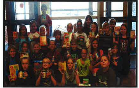
Westview Elementary School students collected food for local food pantries.