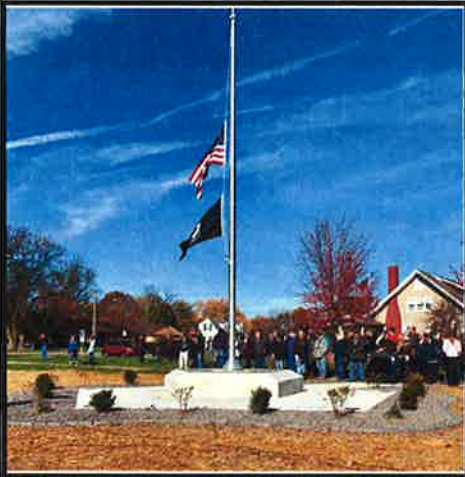
The ceremony moved outside for the monument dedication in front of the high school.