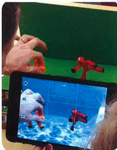
Hands on training for our elementary staff during their professional development day.