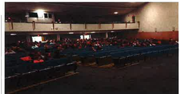
Incoming Freshmen and their parents getting to meet the Freshmen Academy teachers.