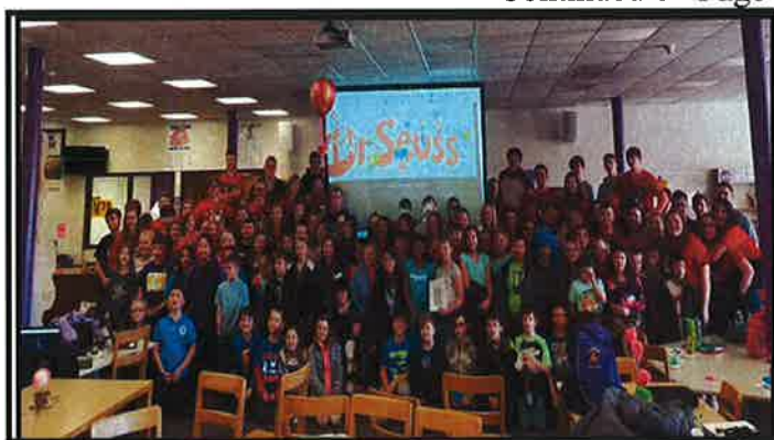
Fourth grade students and sophomore English students read Dr. Seuss for Read Across America.