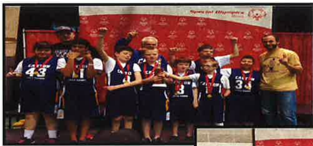
The Ingersoll (above) and Canton High School (right) State Special Olympics Basketball Tournament.