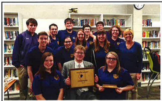
The CHS Scholastic Bowl Varsity team won the Fulton County Tournament in 2018.