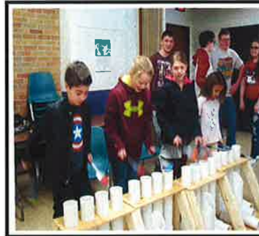
4th Grade students making music at the HS during the Dr. Suess Read Across America.

and problem solving. They enjoyed tasty snacks made by the Foods class and enjoyed a musical number performed by some of the musical students as well. Each fourth grader worked with a high school student to complete their tasks. Eastview students and their families will have the opportunity to participate in a family night on April 5th, the 3rd and 4th grade music program on April 12th and the Eastview Ice-cream Social on April 26th. We look forward to seeing everyone at our upcoming events.