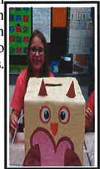
Taking time out from the party to pose with her Valentine's Day Box.