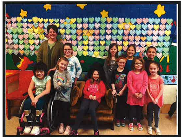
Lincoln February STAR students.